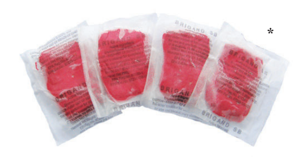
*not representative of a bait placement