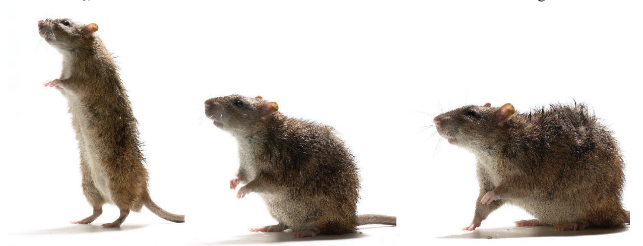
Please note, pictures of Rats to be used alongside pictures of bait