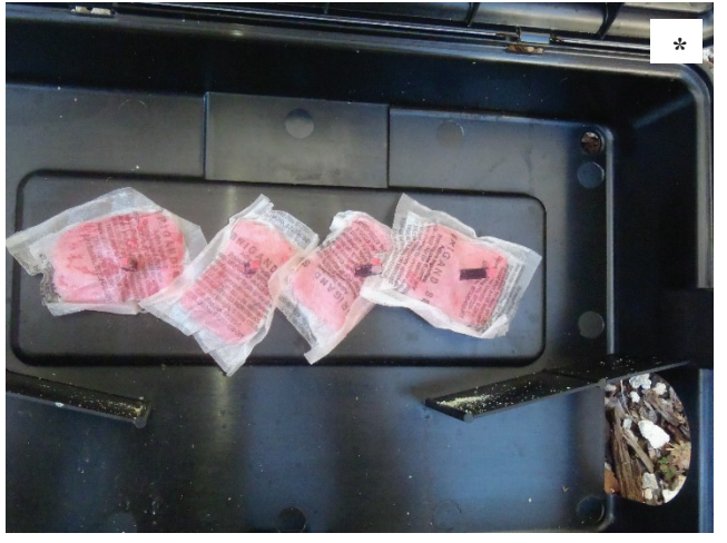
*bait as it appears secured on rods inside rodent bait stations